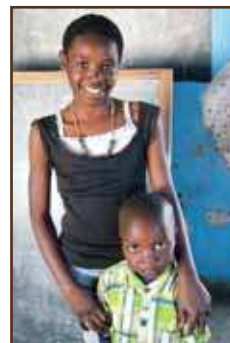
Students at Mtendere.

and a constant eye toward "getting our story out there". We are incredibly fortunate to have had the dedication of such gifted individuals and will be forever in their debt.